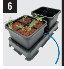
Fill pots with medium and pot up plants. Water through pots and allow to drain outside the tray.

Push the medium down through holes in the Base (5b) - this is essential for capillary action to occur.