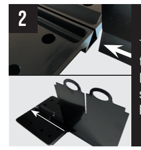
To assemble PotDivider take the Bottom Divider (see Contents above) and slide into the guide on the Base.

Put marix or root control discs (not supplied) into your 8.5L / 2.2 gal or 15 L / 3.9 gal pots (not supplied).