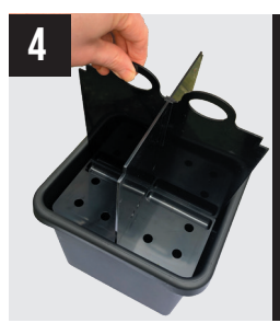
Place the assembled PotDivider into your 8.5 L / 2.2 gal or 15 L / 3.9 gal pot.

Take the Top Divider (see Contents above) and slot down into the slot in the Bottom Divider using the guides to create a cross-shape.